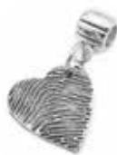
Heart | $394

The sterling silver charm carrier fits Pandora bracelets.