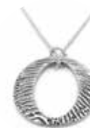
Eternity 20" $480