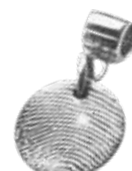
Circle | $394