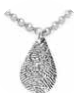
Teardrop 20" $430 | 24" $544