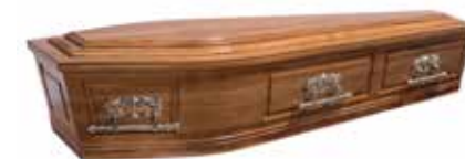
Solid Rimu Panelled