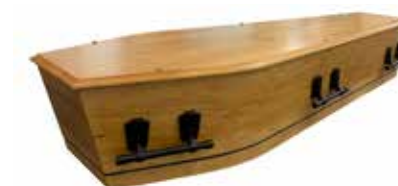
Flat Lid Solid Pine, Teak