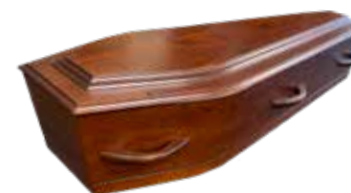
Raised Lid Solid Pine, Mahogany