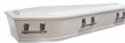
Painted White Raised Lid

Environmental considerations include material choice, assembly options, handles, finishes, and using less material to make the caskets.