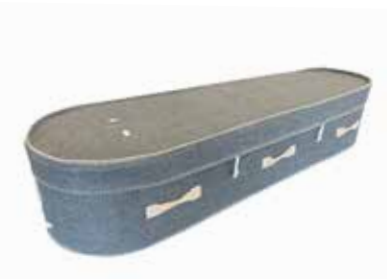
Grey Woollen Casket