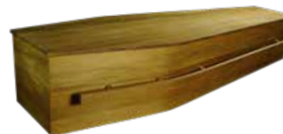
Archtype Silver Beech